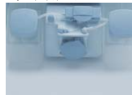
*Irrigation pump (optional).

The main functions can be controlled with the new footswitch, including ultrasonic/polisher selection, pre-programmed power modes, multi-function pump* control and boost and dry modes. Your hands are free and you can concentrate fully on the treatment.